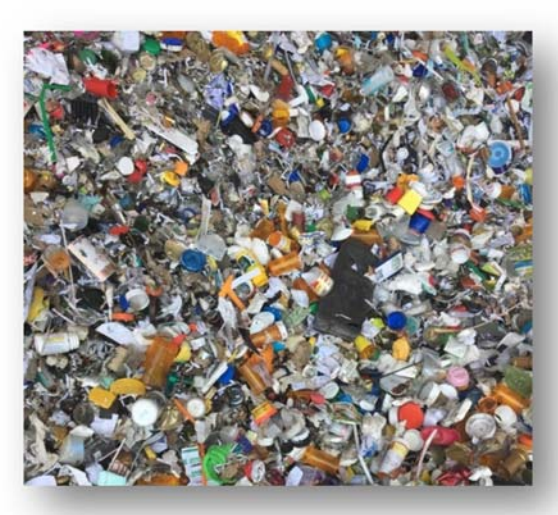
Glass at the MCRC

A. Single-use plastics contaminate otherwise good recyclables. If a load of recycling contains non-recyclables – even by just a fraction – that entire load risks not being recycled. In many cases, single-use plastics are improperly sorted into the glass stream at the recycling center due to their small size. This photo shows the sorted glass at the MCRC. You can see caps, lids, straws, pill bottles, shredded paper, and a variety of small plastic pieces. The presence of these materials makes it very difficult to reuse and recycle glass.