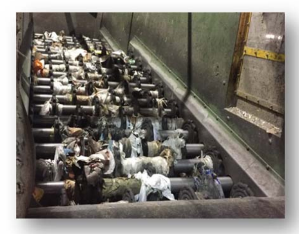
Plastic bags at the MCRC

A. Plastic bags are recyclable through store drop off programs and at the ecopark, but NOT through curbside Mixed Recycling. After bags and plastic films are returned to stores, they are sent to a processing facility specifically designed to recycle flexible plastic wrap. The MCRC has been engineered to process paper and rigid containers, not flexible films. Plastic bags wrap around the rotating gears at MRFs, requiring employees to stop equipment at least once a day to cut bags out of the equipment. This reduces the efficiency of the recycling process and increases labor and equipment costs. Also, it is extremely important that bags and wraps are clean and dry, and collecting them in curbside bins with bottles and containers generally leaves them too dirty and wet to be recycled.