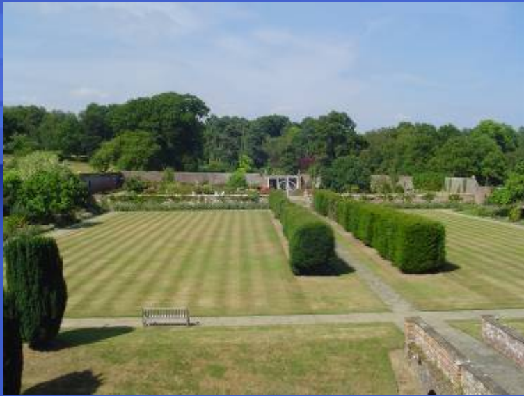
Views around the castle...