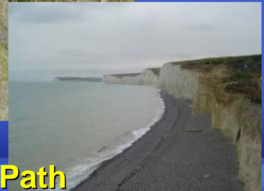
White Cliff and Beach Head Path