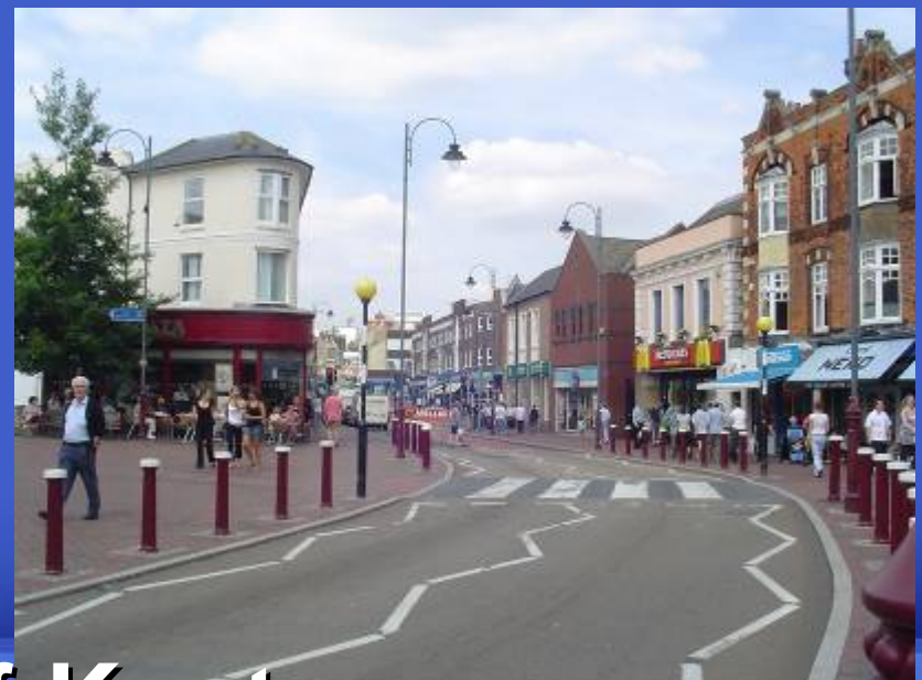
Town of Kent