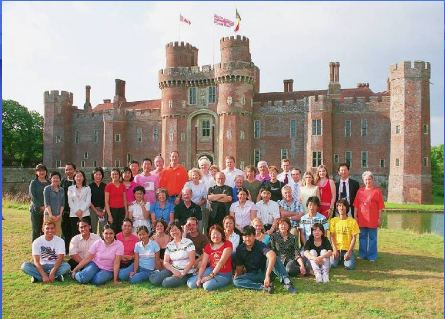
Group photo in front of the castle.