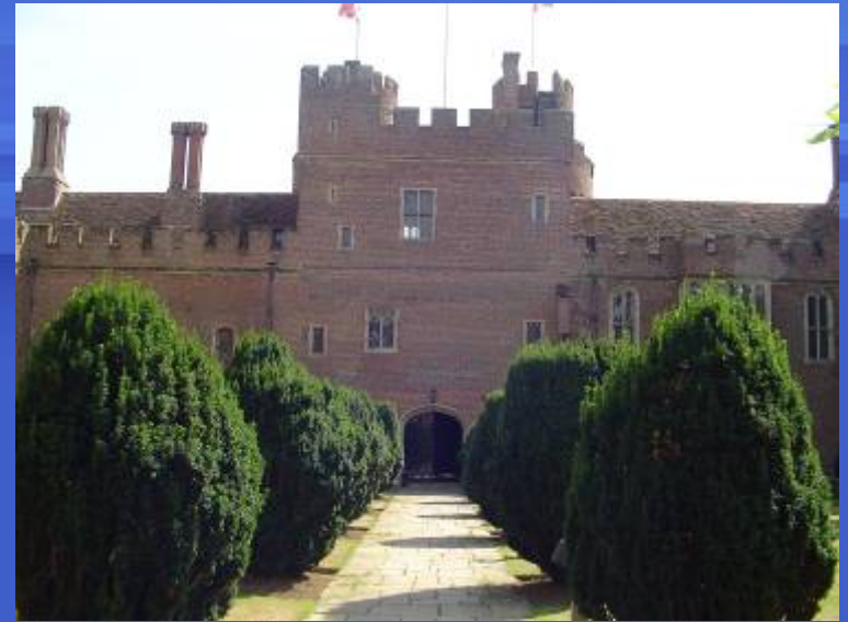
Views of the indoor courtyard