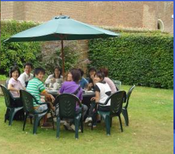
Views of the Garden