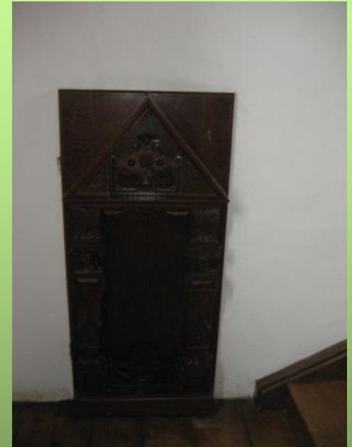
In past years, owners and residents of the castle entered and hid in the small door. Strangers and invaders would think that it was just a wood wall.