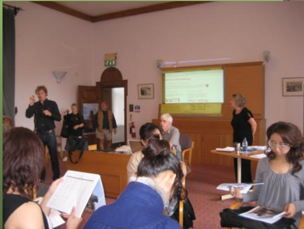
Chinese students and interpreters