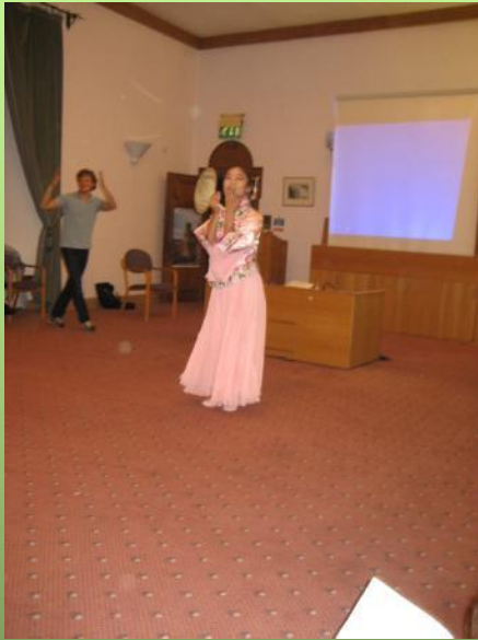
Traditional Chinese dance