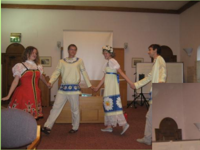
The Russian performed a Russian dance.