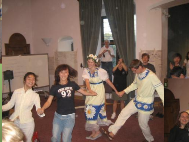
All of us were dancing together.