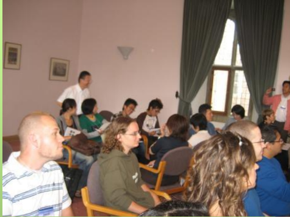
Japanese students and interpreters