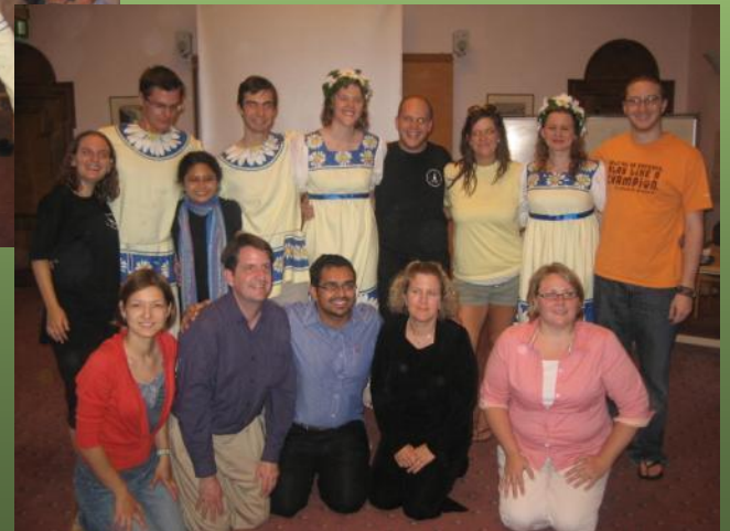
Group picture of Russia and USA.