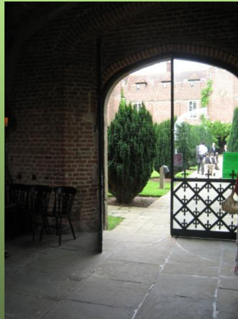
Beautiful and tall bushes of garden are inside the castle