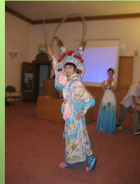
Like "Warrior" Chinese dance