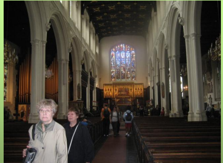
St Margaret's Church is next to the Collegiate Church of St. Peter at Westminster.

The Collegiate Church of St. Peter at Westminster. Diana Princess and her ex-husband Charles attended this church for their wedding.