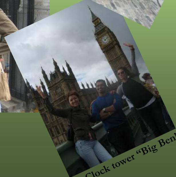
Clock tower "Big Ben"