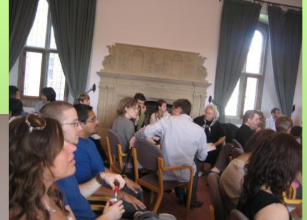
Russian students and interpreters