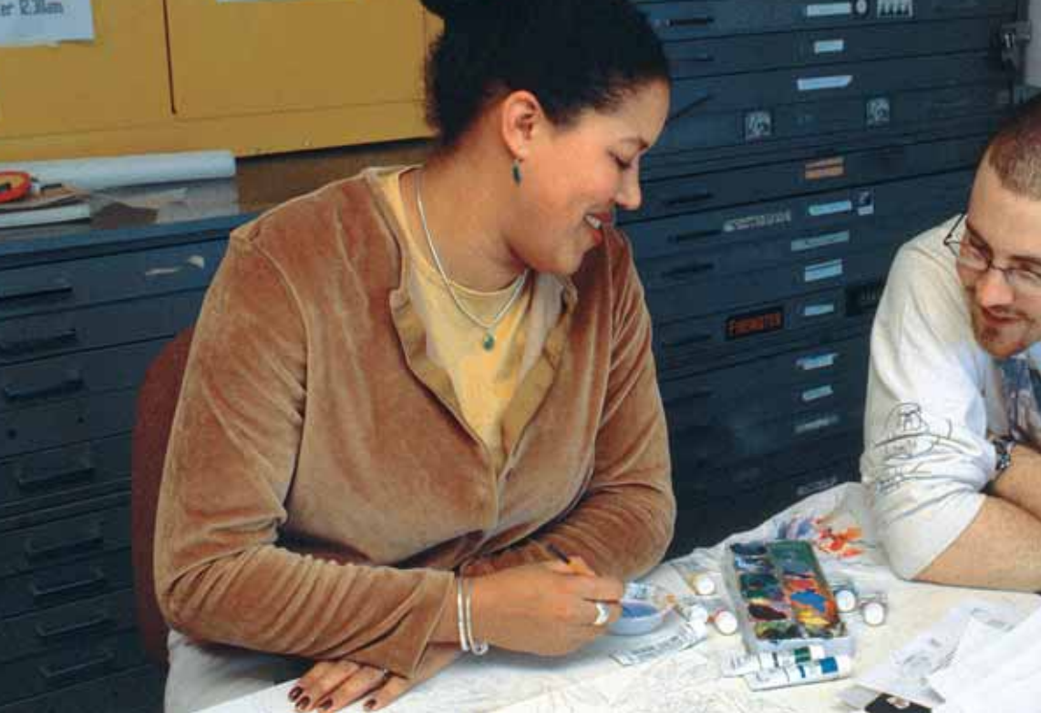
A private studio gives Art House residents space to work.