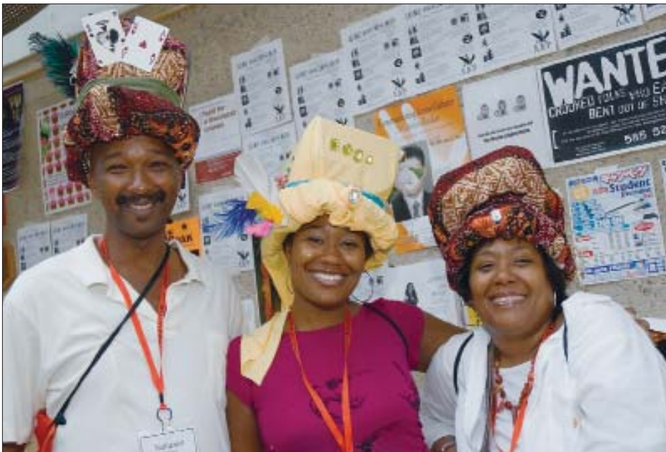
A student and her family show off the hats they created, one of the weekend's most popular activities.