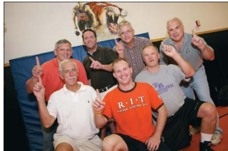
RIT wrestlers share memories of their favorite sport; just one of many athletics reunions that are part of every Brick City Homecoming