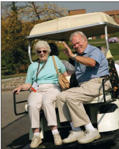
Gold Circle alumni – who graduated 50 years ago or earlier – toured campus on golf carts.