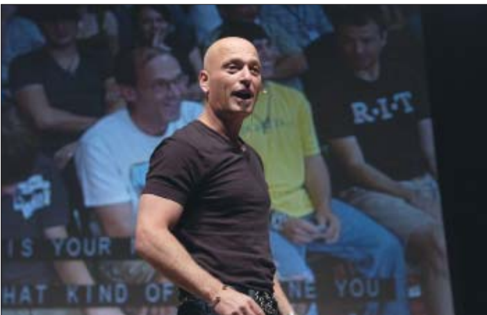
Saturday night headliner Howie Mandel entertains the crowd at the Gordon Field House.