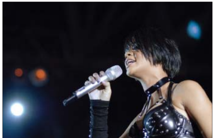
Barbados-born pop singer Rihanna's Friday night show was sponsored by the College Activities Board.