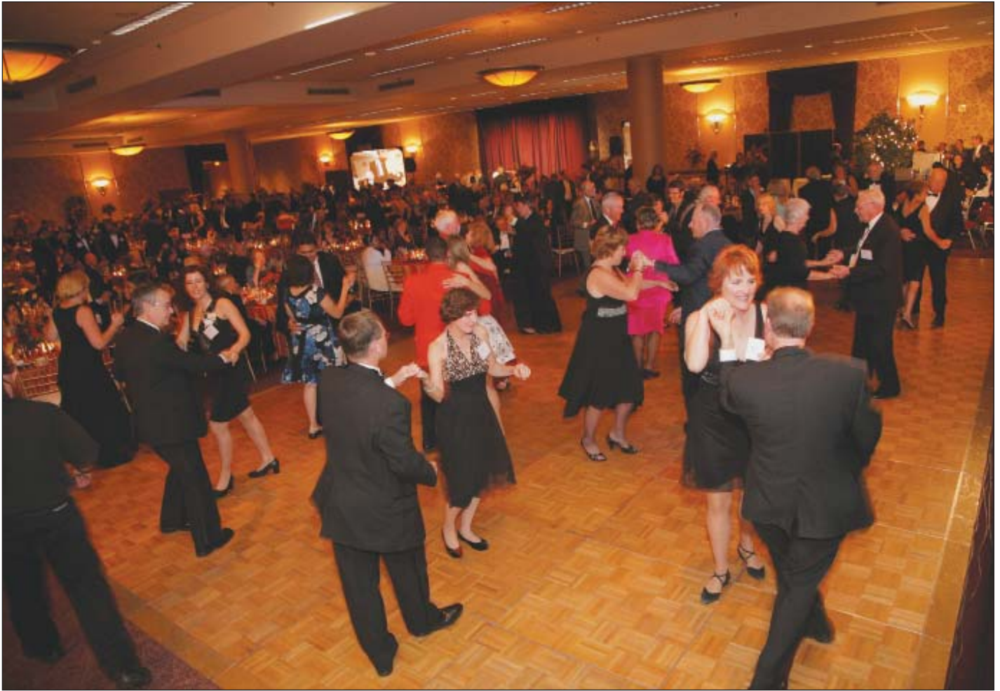
Celebrants at the second annual President's Alumni Ball filled a ballroom at the Rochester Riverside Convention Center for dinner and dancing to the sounds of popular party band The Skycoasters.