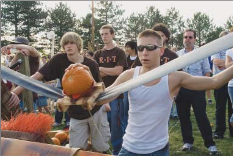
Mechanical engineering technology students competed in a pumpkin-tossing event using a wide variety of devices built to propel the gourds.