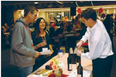
Parents enjoyed wine and cheese at the first "Welcome Parents" reception.